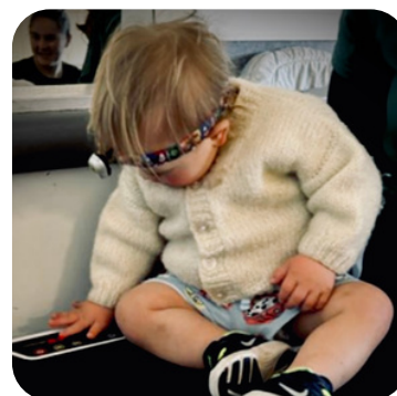
Testing the Hypervibe vibration platform

We are currently expanding our Hydrotherapy programme to include a wider range of professionals, including Occupational Therapists, Speech Language Therapists, Early Intervention Teachers, and Music Therapists. Hydrotherapy not only reduces the impact of gravity, making movement more accessible, but also provides a sensory-rich, highly motivating environment. The pool is an ideal setting not just for practicing gross motor skills, but also for fostering development in communication, social interaction, and fine motor abilities.